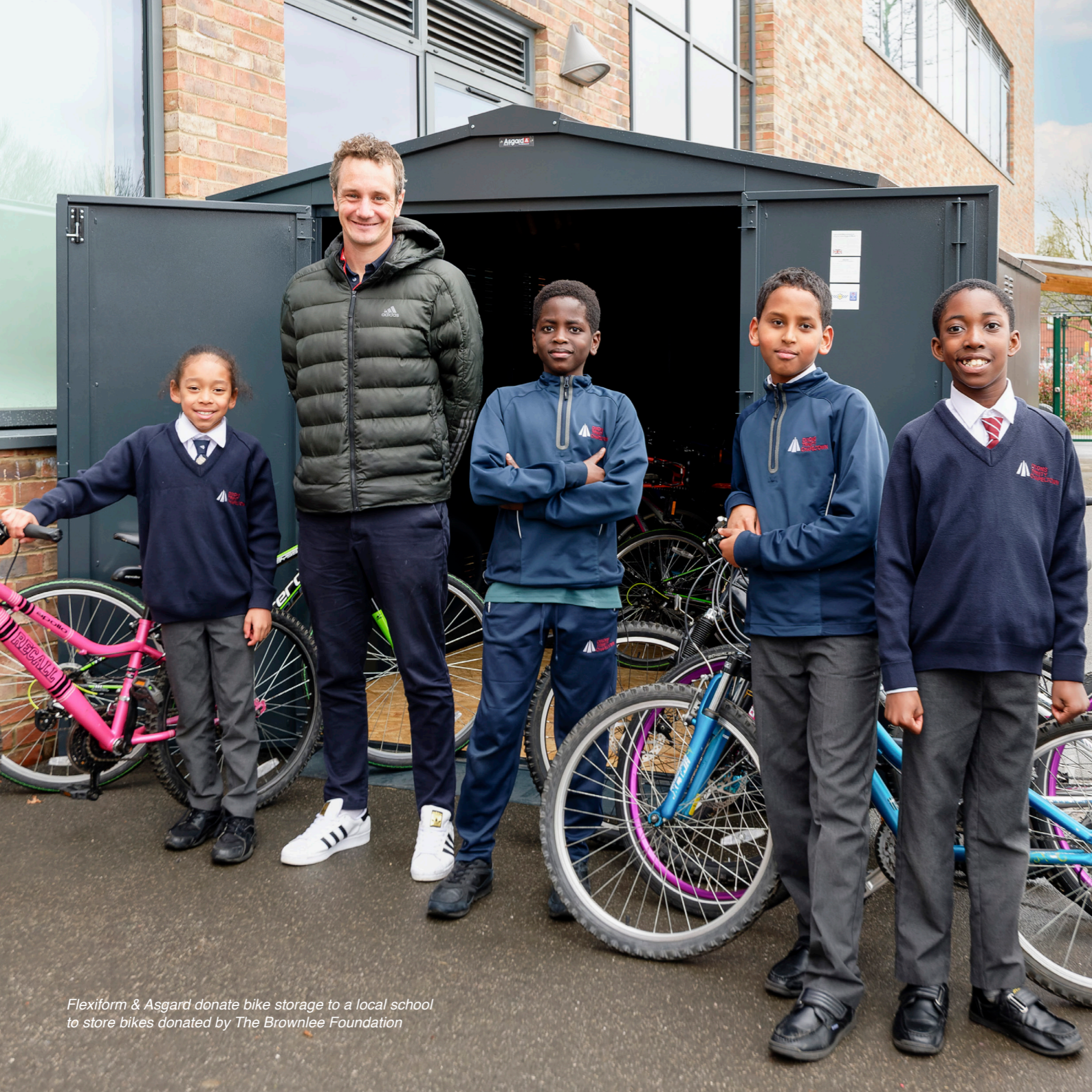
Flexiform & Asgard donate bike storage to a local school to store bikes donated by The Brownlee Foundation