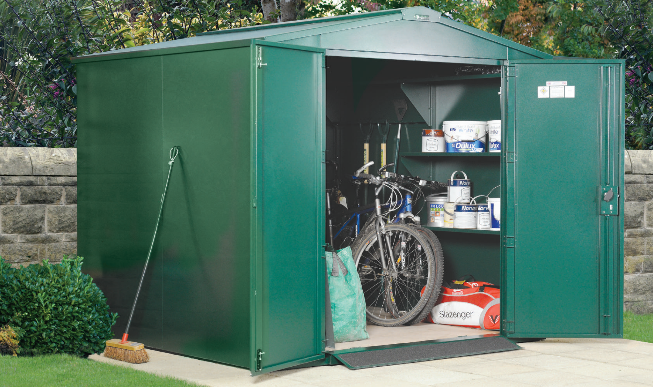
Gladiator School Pack 3