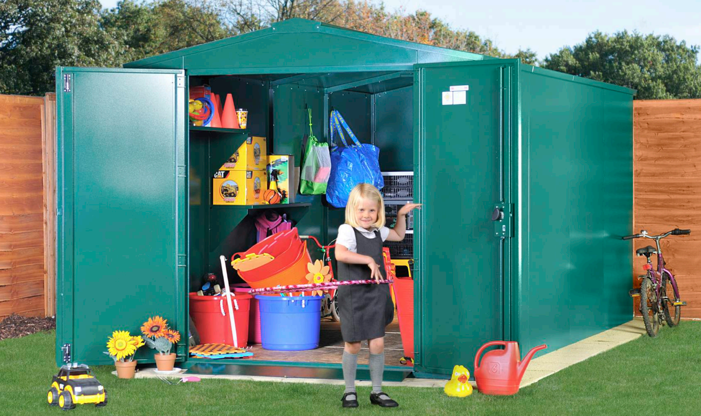
Gladiator Plus 2 School Pack 10